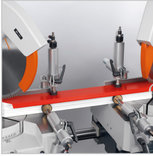
Double mitre saw DG 79