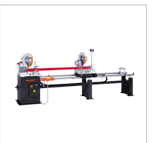
Double mitre saw DG 79 DG 79 + E 111