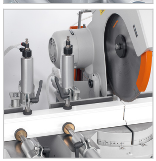
Double mitre saw DG 79