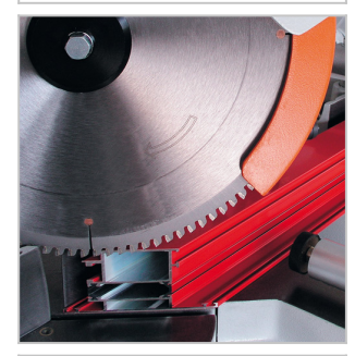
Double mitre saw DG 79