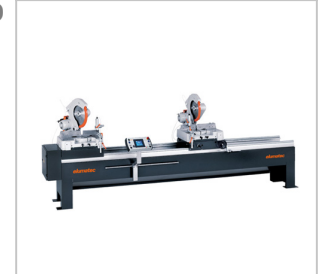
Double mitre saw DG 79 M DG 79 M + E 355