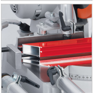
Double mitre saw DG 79